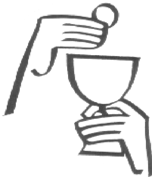
The Body and Blood of Christ