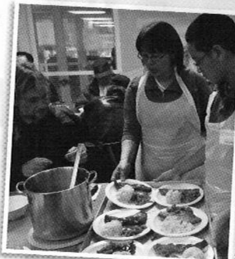
W.P. Watman, Ltd.