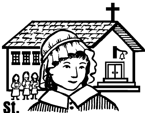
St. Elizabeth Ann Seton