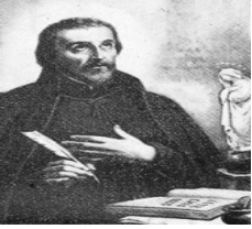
ST. PETER CANISIUS - December 21

Our Lady of Fatima Pleaded that we pray the Holy Rosary before Sunday Mass and privately from 9:00 am to 6:00 pm daily.