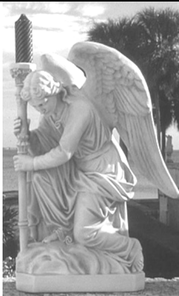
A Guardian Angel

O.L.F. has placed at the main entrance of its worship space a statue of this Angel as a reminder to all who enter that they must experience purification before encountering that which is Holy and ineffable.