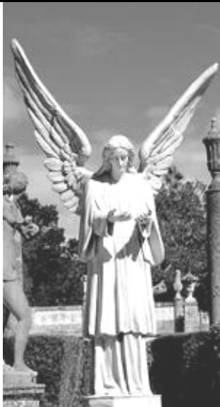
The Angel of Fatima

From the very beginning the One, Holy, Catholic, and Apostolic Church has used sights and sounds as audio-visual aids to help us pray. Material beauty has a way of lifting the human spirit to contemplate God.