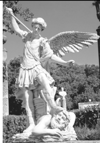
The Archangel Michael

O.L.F. has placed two statues of Guardian Angels on either side of our seasonal "Christ Scenes" to remind all of us of our individual (unique and personal) spiritual protectors in the hope that many will recapture an angelic devotion.