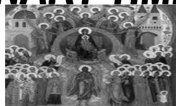
All Saints Day November 1

Our Lady of Fatima Pleaded that we pray the Holy Rosary before Sunday Mass and privately from 9:00 am to 6:00 pm daily.