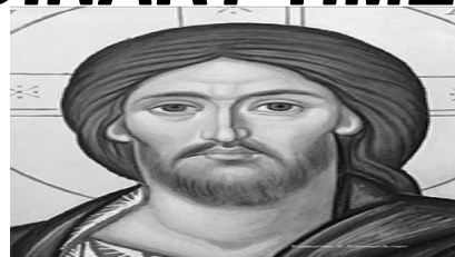
Vocation Awareness Week-Nov. 3-9

Pleaded that we pray the Holy Rosary before Sunday Mass and privately from 9:00 am to 6:00 pm daily.