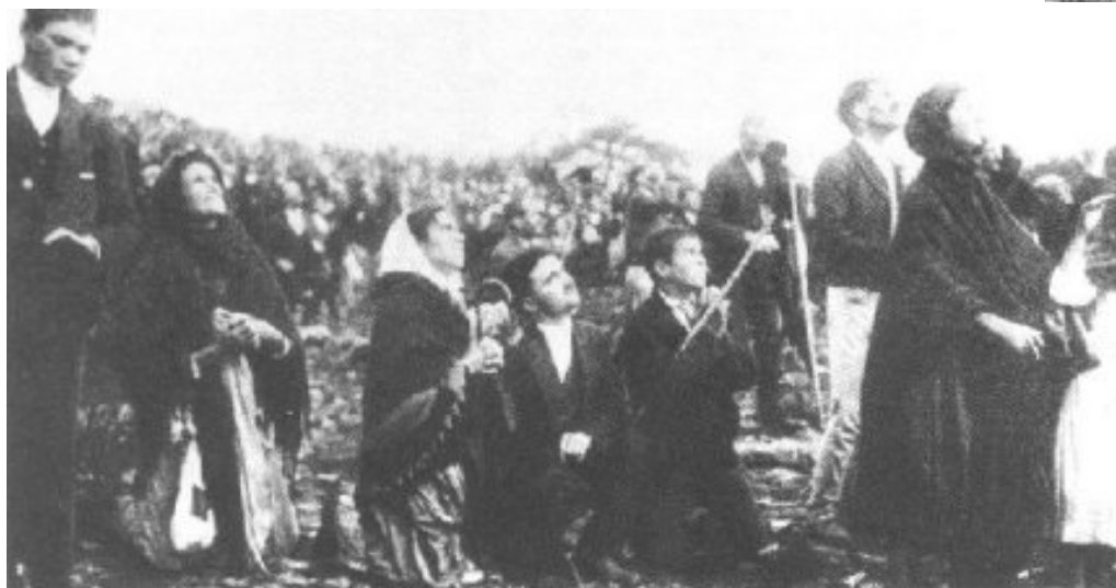
Photograph taken during the reputed "Dance of the Sun" at Fatima on 13 October 1917.